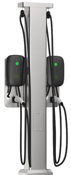
Dual side-to-side cable management system