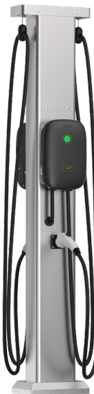
Back-to-back pedestal with cable management system